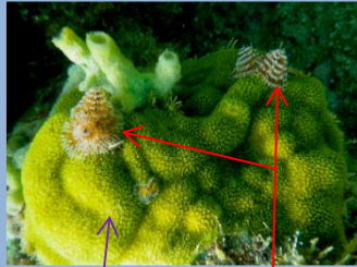
Mustard Hill Coral, S-M, 4-5, Rf. Porites astreoides , with Christmas Tree Worms