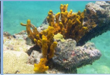
?Brown Sponge?, S-M, 4-5, Rf. ? Neopetrosia subtriangularis