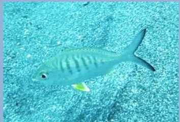
Yellowfin Mojarra, M, 2-3, So, Ow & Sa. Geres cinereus