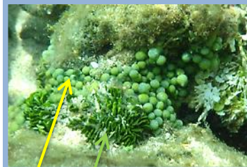
Green Grape Alga ( Caulerpa racemosa ) & Watercress Alga ( Halimeda opuntia )