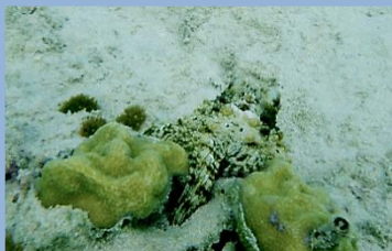
Common Octopus, M, 3-5, Rf. Octopus vulgaris .