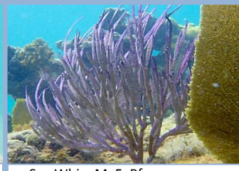
Sea Whip, M, 5, Rf. Pterogorgia anceps