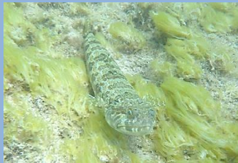
Sand Diver, S-M, 5, So, Rf & Sa. Synodus intermedius