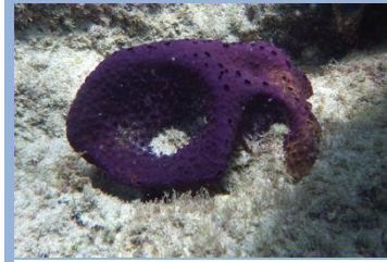
Morph of Branching Tube Sponge, S-M, 5, Rf. Aiolochoiria crassa