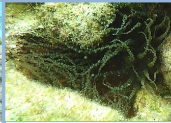
Corkscrew Anemone, S, 4-5, Rf. Bartholomea annulata