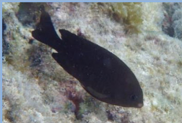
Longfin Damselfish?, S, 5, So, Rf. Stegastes diencaeus