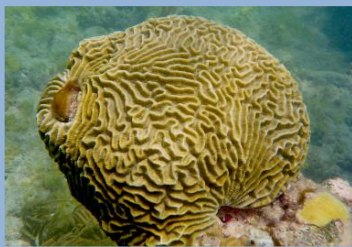
Symmetrical Brain Coral, L, 5, Rf. Diplora strigosa