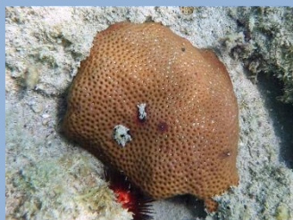
Massive Starlet Coral, M-L, 5, Rf. Siderastrea siderea