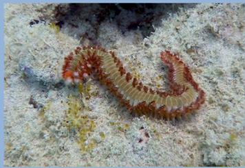
Bearded Fireworm, S, 3-5, Rf. Hermodice carunculata ☹️