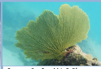
Common Sea Fan, M-L, 5, Rf. Gorgonia ventalina