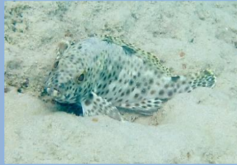
Rock Hind, M, 4, So, Rf. Epinephelus adscensionis