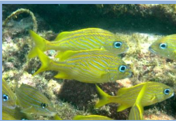
French Grunt, M, 4 & 5, Sh, Rf. Haemulon flavolineatum