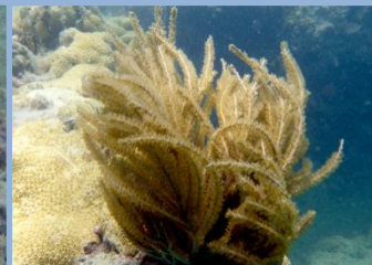
? Spiny Sea Fan/Rod, M-L, 5, Rf. Muricea sp.