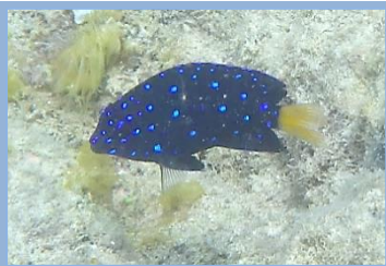
Yellowtail Damselfish (juv.), S-M, 5, So, Rf. Microspathodon chrysurus