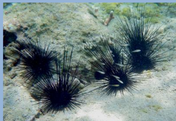
Long-Spined Urchin, S-M, 4-5, Rf. Diadema antillarum ☹️