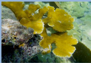
Elkhorn Coral, L-VL, 4-5, Rf. Acropora palmata