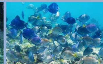
Mixed shoal of Blue Tang, Ocean Surgeonfish and Doctorfish, Area 5.