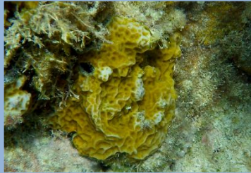
Low Relief Lettuce Coral, S, 5, Rf. Agaricia humilis