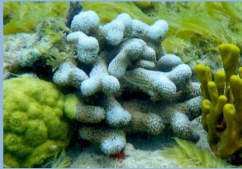
Finger Coral, M-L, 5, Rf. Porites porites