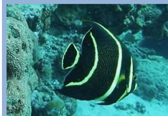
Juvenile French Angelfish, S-M, 5, So, Rf. Pomacanthus paru .