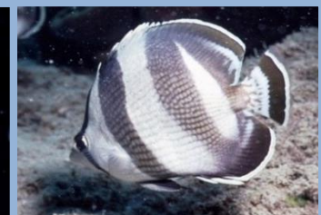
Banded Butterflyfish, S-M, 5, So, Rf. Chaetodon striatus .