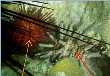
Rock-Boring ( Echinometra lucuter ) & Slate-Pencil urchin ( Eucidaris tribuloides ), S, 5, Rf.