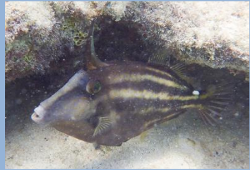
Orangespotted Filefish, M, 4, So, Rf. Cantherhines pullus