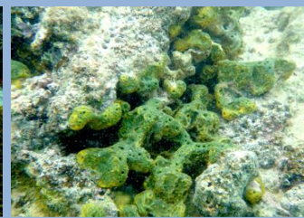
Pitted Sponge, M, 4-5, Rf. Verongula rigida