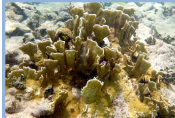
Blade Fire Coral, S-L, 4-5, Rf. Millepora complanata ☹️