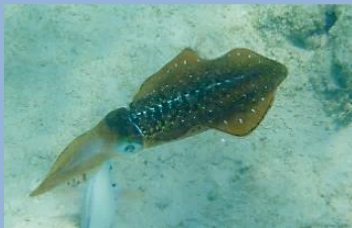
Caribbean Reef Squid, S-M, 3-4, Ow. Sepioteuthis sepioidea .