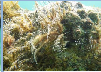
?Christmas Tree Hydroid, VS-S, 3-5, Rf. Halocordyle disticha