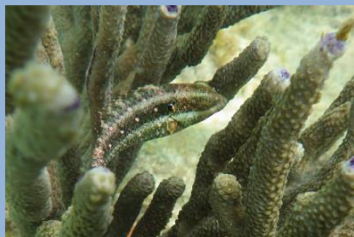
?Juv. Redband Parrotfish, S, 5, So, Rf. Sparisoma aerofrenatum