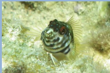
Goldline Blenny, S, 4 & 5, So, Rf. Malacoctenus aurolineatus