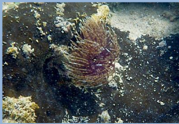
Magnificent Feather Duster, S, 3-5, Rf. Sabellastarte magnifica