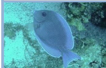
Blue Tang, M, 5, Sh, Rf. Acanthurus coeruleus