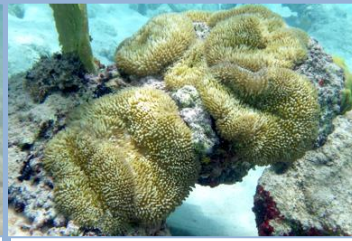
Sun Anemone, M, 4-5, Rf. Stichodactyla helianthus