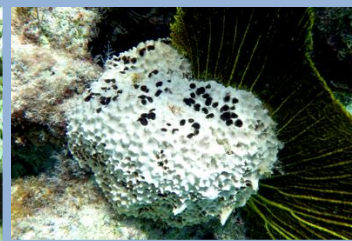
Black-Ball Sponge, S-M, 5, Rf. White morph. Ircinia strobilina