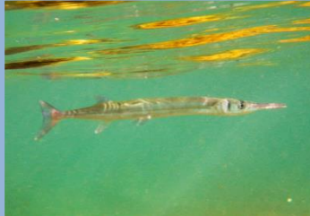
? Houndfish, M-L, 5, So and Sh, Ow. Tylosurus crocodilus ☹️