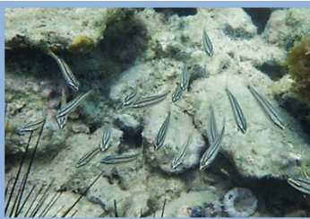
Shoal of juvenile French Grunt, S, 4, Sh, Rf