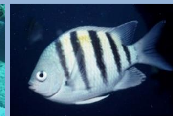
Sargeant Major, S-M, 5, So & Sh, Rf. Abudefduf saxatilis .