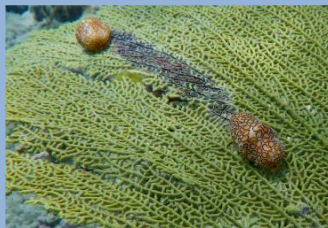
Flamingo tongue, S, 5, Rf. Cyphoma gibbosum .