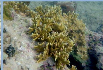
Branching Fire Coral, S-L, 4-5, Rf. Millepora alcicornis ☹️