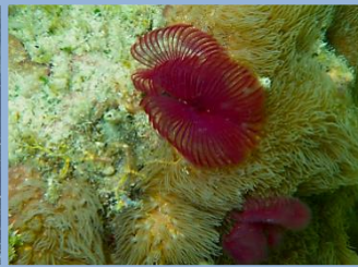
Split-Crown Feather Duster, VS, 3-5, Rf. Anamobaea orstedii