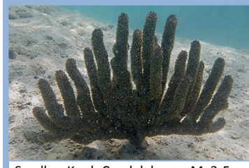
Swollen-Knob Candelabrum, M, 3-5, Rf. Eunicea mammosa