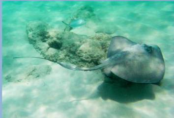
Southern Stingray, L, 2-3, So, Ow & Sa. Dasyatis americana ☹️