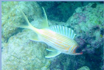
Longspine Squirrelfish, S-M, 5, So, Rf. Holocentrus rufus .