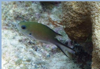
Brown Chromis, S, 3-5, Sh, Rf. Chromis multilineata