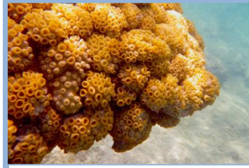
White Encrusting Zoanthid, as a colony L-VL, 5, Rf. Palythoa caribaeorum