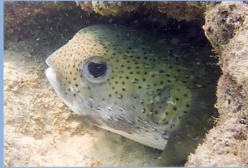
Porcupinefish, M-L, 3-4, So, Rf. Diodon hystrix