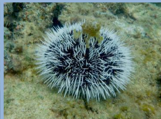
West Indian Sea Egg, S, 3-5, Rf. Tripneustes ventricosus .