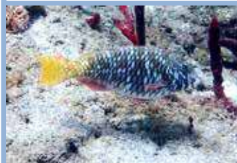
Yellowtail Parrotfish (initial phase). M, 1, So, Rf. Sparisoma rubripinne .