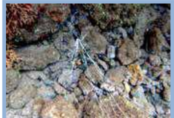
Spaghetti Worm. S, 1, So, Rf/Sa. Eupolymnia crassocornis.