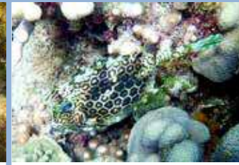
Honeycomb Cowfish. S-M, 1, So, Rf. Acanthostracion polygonia