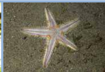
Striped Sea Star. S, 1, So, Sa. Luidia clathrata.