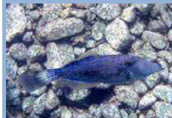
Scrawled Filefish. M, 1, So, Rf. Aluterus scriptus .