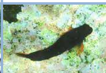
Redlip Blenny. VS-S, 1, So, Rf. Ophioblennius macclurei .