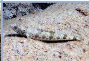
Sand Diver. M, 1 & 4, So, Rf/Sa. Synodus intermedius .