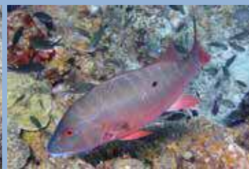
Mutton Snapper. M, 1, So, Rf. Lutjanus analis .