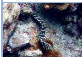
Chain Moray. S-M, 1, So, Rf. Echidna catenata .