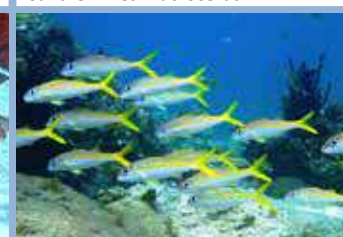
Yellow Goatfish. S-M, 1&3, Sh, Sa & Rf. Mulloidichthys martinicus .