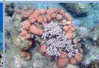
Massive Starlet Coral (surrounding Finger Coral). L, 5, Co, Rf., Siderastrea siderea.