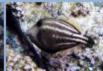
Orangespotted Filefish. S-M, 1, So, Rf. Cantherhines pullus .