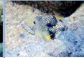
Smooth Trunkfish. S, 1, So, Rf. Lactophrys triqueter .