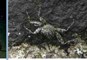
Sally Lightfoot Crab. S, All, Intertidal rock. Percnon gibessi .