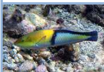
Yellowhead Wrasse. S-M, 1, So, Rf. Halihoeres gamoti .