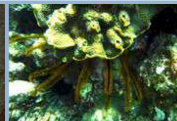
Golden Crinoid. S-M, 1, So, Rf. Davidaster rubiginosa.