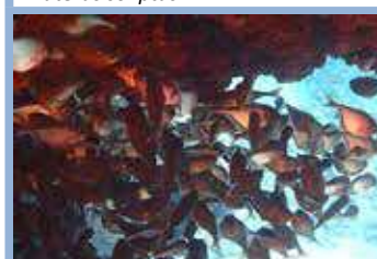
Glassy Sweeper. S, 1, Sh, Rf. Pempheris schomburgki .