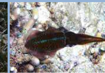
Caribbean Reef Squid. S-M, All, Sh, Rf. Sepioteuthis sepioidea .