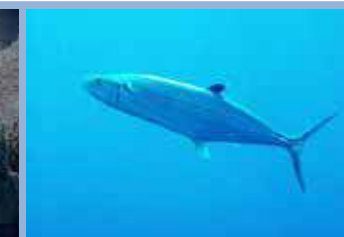
Cero. M-L, 1, So, Ow. Scomberomorus regalis .