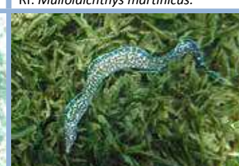
Spotted Moray. S-M, 1&3, Rf & Sg. Gymnothorax moringa .