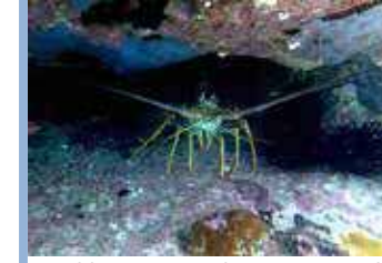
Caribbean Spiny Lobster. M, 1, So & Sh, Rf. Panulirus argus .