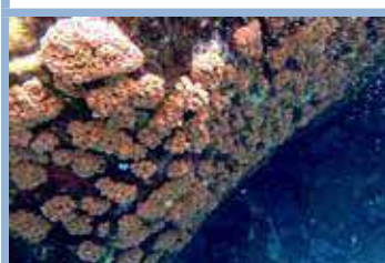
Sun Coral. S, 1, Sh & Co, Rf. Closed during day. Tubastraea coccinea.