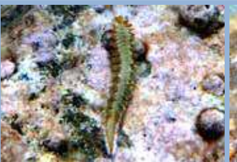
Bearded Fireworm. S, 1, So, Rf & Sg. Hermodice carunculata. ☹️