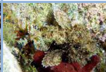
Spotted Scorpionfish. S-M, 1, So, Rf. Scorpaena plumieri . 🐊