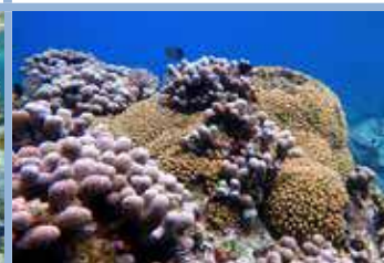
Finger Coral (Lft). M, 1, Co, Rf. Porites ?porites. Yellow Pencil Coral (Rht). M, 1, Co, Rf. Madracis mirabilis.