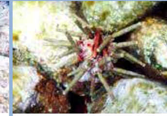
Slate Pencil Urchin. S, 4, Rf. Eucidaris tribuloides .