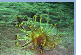
Banded Tube Dwelling Anemone. S-M, 1, So, Sa. Isarachnanthus ?nocturnus.