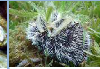
West Indian Sea Egg. S, 3, Sg. Tripneustes ventricosus .