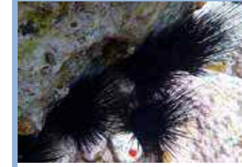
Long-Spined Urchins. M, 1, Rf. Diadema antillarum . 🐊