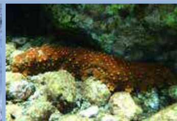
Three-Rowed Sea Cucumber. M, 1, So, Rf. Isostichopus badionotus.