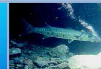
Great Barracuda. M-L, 1, So, Ow. Sphyræna barracuda .