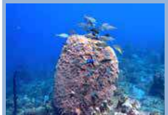
Giant Barrel Sponge. L, 1 & 5, Co, Rf. Xestospongia muta.