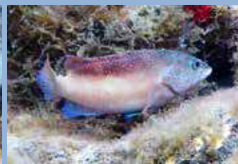
Coney. M, 1, So, Rf. Cephalopholis fulva .