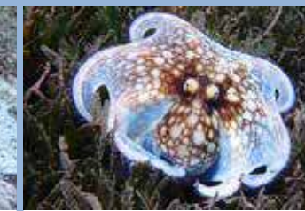
Common Octopus. S-M, 1&3, So, Rf & Sg. Octopus vulgaris .