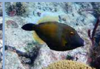
Whitespotted Filefish. S-M, 1, So, Rf. Cantherhines macrocerus