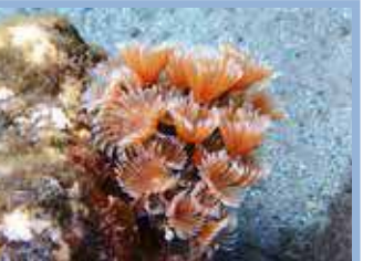
Social Feather Duster. S, 1, Sh, Rf. Bispira brunnea.