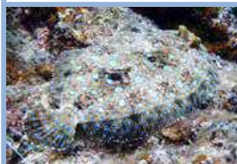
Peacock Flounder. M, 1, So, Rf. Bothus lunatus .