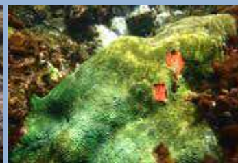
Knobby or Encrusting Brain Coral. M, 1, Co, Rf. Diploria clivosa.