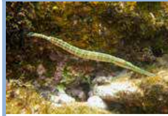
Trumpetfish. M-L, All, So, Rf. Aulostomus maculatus .