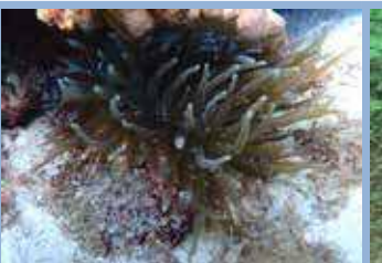
Giant Anemone. S-M, 1, So, Rf. Condylactis gigantea.