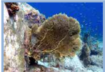
Common Sea Fan. M-L, 5, Co, Rf. Gorgonia ventalina.