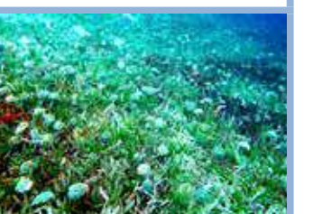
Broadleaf Seagrass & Mermaid's Shaving Brush Alga. 3, Sg.