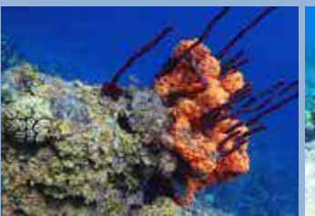
Orange Elephant Ear Sponge & Erect Rope Sponge. M, 1, Co, Rf.