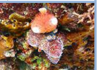
Christmas Tree Worm. Vs, 1, So & Sh, Rf. Spirobranchus giganteus.