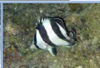
Banded Butterflyfish. S, 1, So, Rf. Chaetodon striatus.