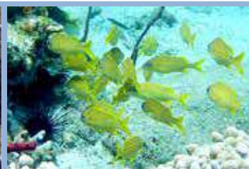
French Grunt. S-M, 1, Sh, Rf. Haemulon flavolineatum .