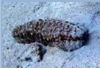
Donkey Dung Sea Cucumber. M, 1, So, Sa. Holothuria mexicana.