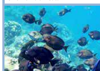
Ocean Surgeonfish. M, 1 & 3, Sh, Rf. Acanthurus bahianus.