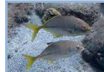
Horse-Eye Jack. M, 1, Sh, Ow. Caranx latus .