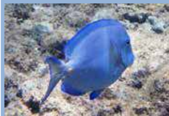
Blue Tang. M, 1, So & Sh, Rf. Acanthurus coeruleus .