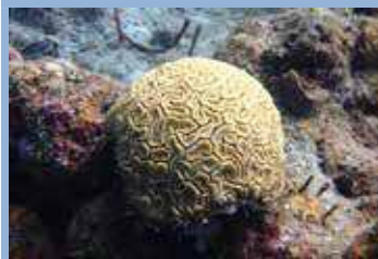
Grooved Brain Coral. S-M, 1, Co, Rf. Diploria labyrinthiformis.