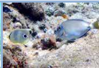
Four-eye Butterflyfish (Lft). S, 1, So, Rf. Chaetodon capistratus . With an Ocean Surgeonfish (Rht)