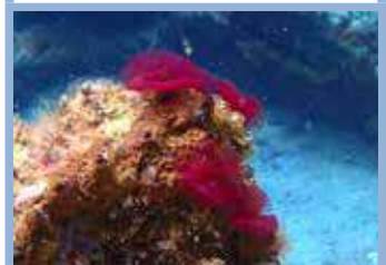
Split-Crown Feather Duster. S, 1, Sh, Rf. Anamobaea orstedii.