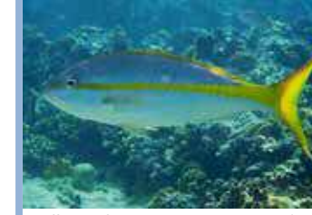
Yellowtail Snapper. M, 1, So or Sh, Ow. Ocyurus chrysurus .