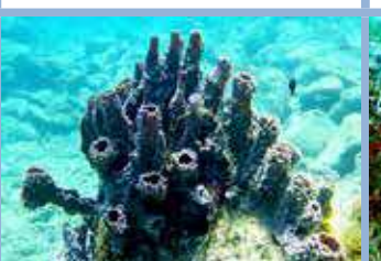
Branching Vase Sponge. M, 1, Co, Rf. Callyspongia vaginalis.