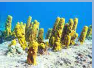
Yellow Tube Sponge. M, 2, Co, Rf. Aplysina fistularis.