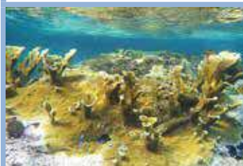
Elkhorn Coral. M-L, 2, Co, Rf. Acropora palmata.