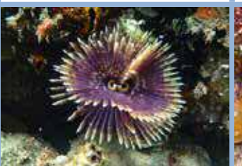
Magnificent Feather Duster. S, 1, So, Rf. Sabellastarte magnifica.