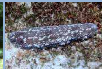
Furry Sea Cucumber. M, 5, So & Sh, Sa & Sg. Astichopus multifidus.