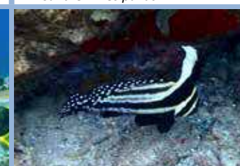
Spotted Drum. S, 1, So, Rf. Equetus punctatus .