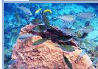
Brown Chromis. S, 1, Sh, Rf. Chromis multilineata.