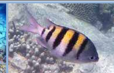
Sergeant Major. S, 1, Sh, Rf. Abudefduf saxatilis.