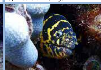
Close up of Chain Moray.