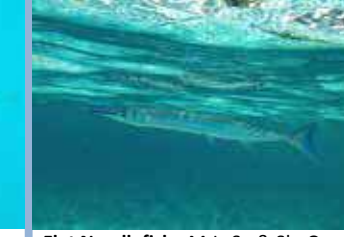
Flat Needlefish. M-L, So & Sh, Ow. Blennes hians .