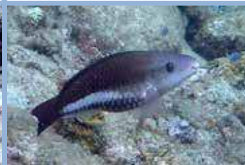
Queen Parrotfish (initial phase). M, 1, So, Rf. Scarus vetula .