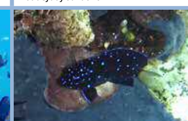
Yellowtail Damselfish (Juv). S, 1, So, Rf. Microspathodon chrysurus.