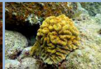
Maze Coral. S, 1, Co, Rf. Meandrina meandrites.