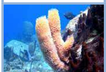
Azure Vase Sponge. M, 1, Co, Rf. Callyspongia plicifera.