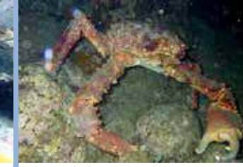
Channel Clinging Crab. M-L, 1, So, Rf. Mithrax spinosissimus .