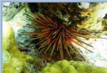
Reef Urchin. S, 1, So, Rf. Echinometra viridis.