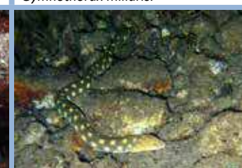
Sharptail Eel. S-M, 1, So, Rf. Myrichthys breviceps .