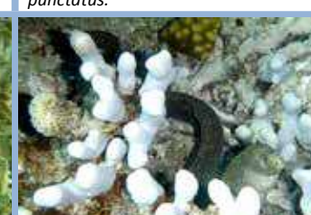
Goldentail Moray. M-L, 1, Rf. Gymnothorax miliaris .