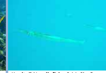
Keeltail Needlefish. S-M, Sh, Ow. Platybelone argalus .