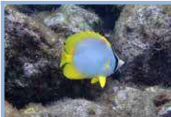
Spotfin Butterflyfish. S, 1, So, Rf. Chaetodon ocellatus .