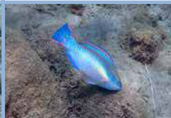
Princess Parrotfish. M, 1, So, Rf. Scarus taeniopterus .